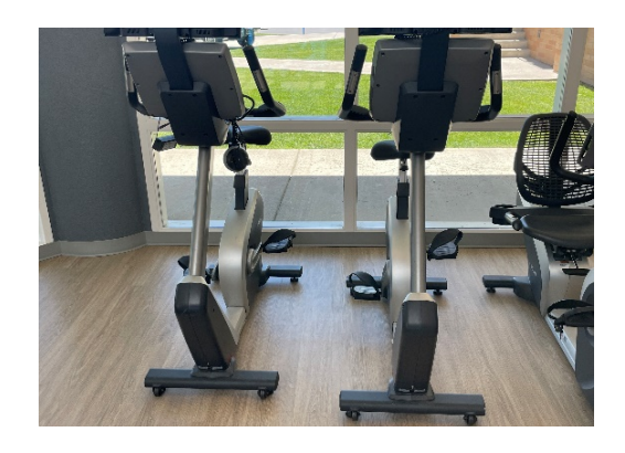
Item 1: Upright Bikes