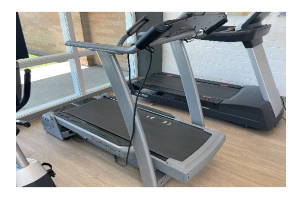
Item 4: Reflex Treadmill