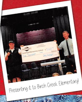
Presenting it to Birch Creek Elementary!