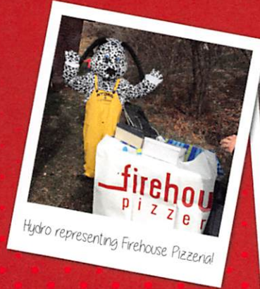
Hydro representing Firehouse Pizzeria!