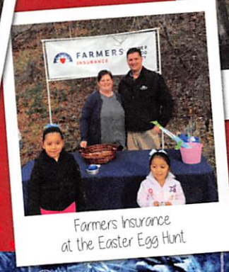
Farmers Insurance at the Easter Egg Hunt