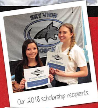
Our 2018 scholarship recipients

Wishing all of you Happy Holidays! The Smithfield Chamber of Commerce