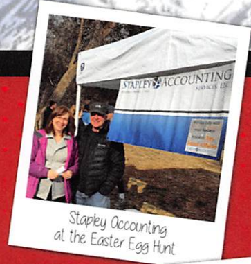
Stapley Accounting at the Easter Egg Hunt