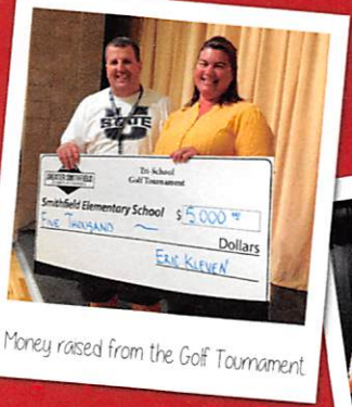
Money raised from the Golf Tournament